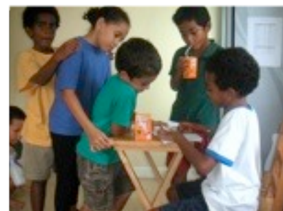
The School has a shop which is run by the more senior children to demonstrate mathematics skills in a more authentic context.

Children have different strengths or weaknesses in these different intelligences. Children are more likely to try and understand the world through the intelligences that they are naturally stronger in. A Multiple Intelligence inspired school tries to offer at least some degree of individualised educational programme in recognition of this fact.